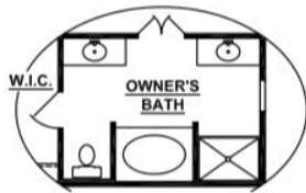
OPTIONAL GLAMOUR OWNER'S BATH